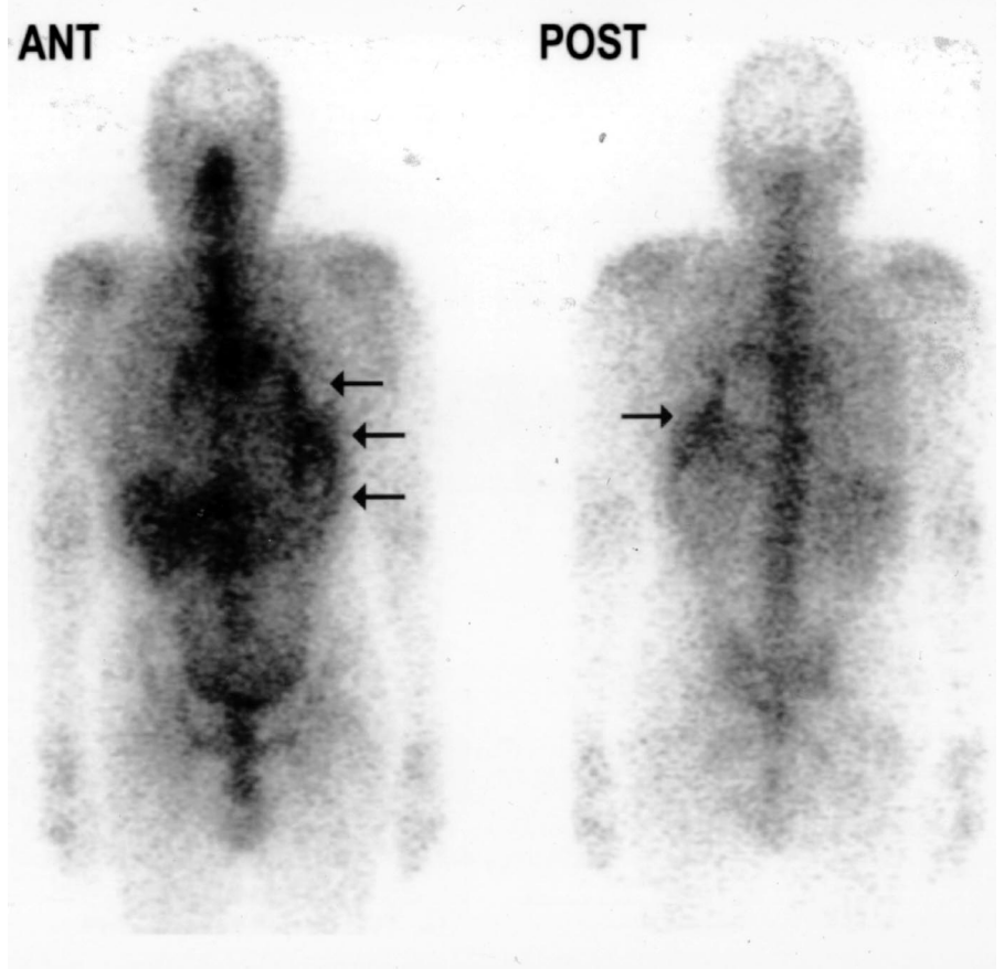
FIGURE 2. Ga-67 scan plays an important role for imaging infection,<sup>2-4</sup> especially in the chest,<sup>5</sup> but is not so reliable in the abdomen because of physiological bowel activity. To minimize the interference of normal bowel activity on a Ga-67 scan, a repeat scan after additional bowel cleansing is frequently needed.<sup>6</sup> Radiotracer in the intestinal lumen usually moves and different patterns of bowel activity are shown between early and delayed images after bowel cleansing. A gallium-avid lesion with a persistent fixed pattern on both images usually implies a true lesion of infection or malignancy. The 48-hour image after bowel cleansing by castor oil showed a different pattern of pulmonary activity (arrows) in comparison with the 24-hour image. It suggested that pulmonary infection might be a false-positive interpretation.