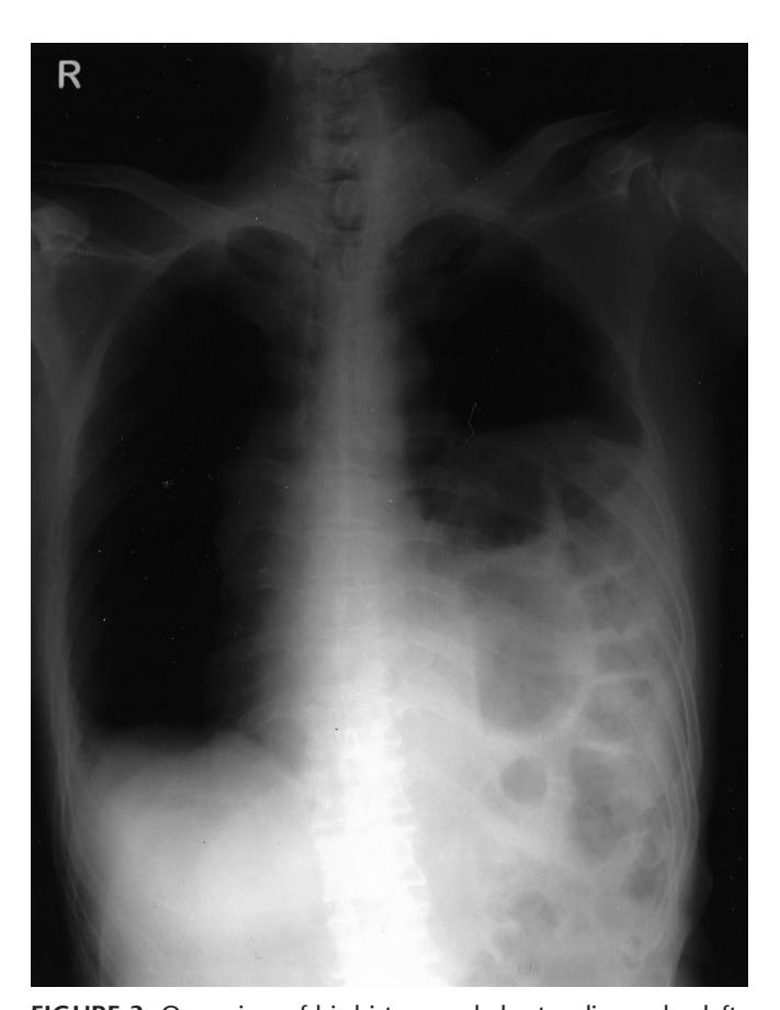
FIGURE 3. On review of his history and chest radiographs, left hemidiaphragm elevation with mild displacement of the heart to the right was noted for more than 10 years. A paralyzed left hemidiaphragm with bowel elevation to the left lower chest was considered as the cause of pulmonary activity on the Ga-67 scan. Hemidiaphragmatic paralysis is a consequence of phrenic nerve injury. The most common causes are trauma and surgery. The most common causes are trauma and surgery. It may be a clinically silent entity, often discovered only when an elevated hemidiaphragm is found on a chest radiograph ordered for another indication. Physiological bowel activity misinterpreted as pulmonary infection has been reported resulting from a hernia. Diaphragmatic paralysis should also be considered as a differential diagnosis of abnormal pulmonary activity on a Ga-67 scan. The patient's history and a review of radiographs for correlation is important for interpreting the Ga-67 scan correctly. The patient was discharged from the hospital after his symptoms improved, but a final diagnosis of infection was not established.