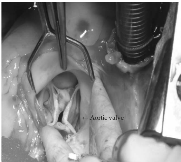
Figure 2. Perioperative view of the aortic valve with four equivalent leaflets.